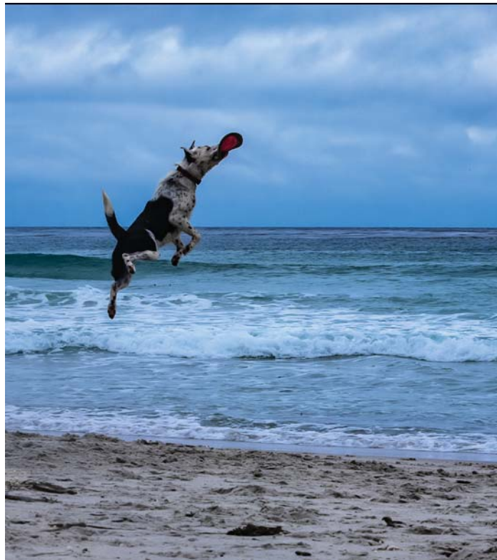
Play Time at the Beach Carol Fuessenich